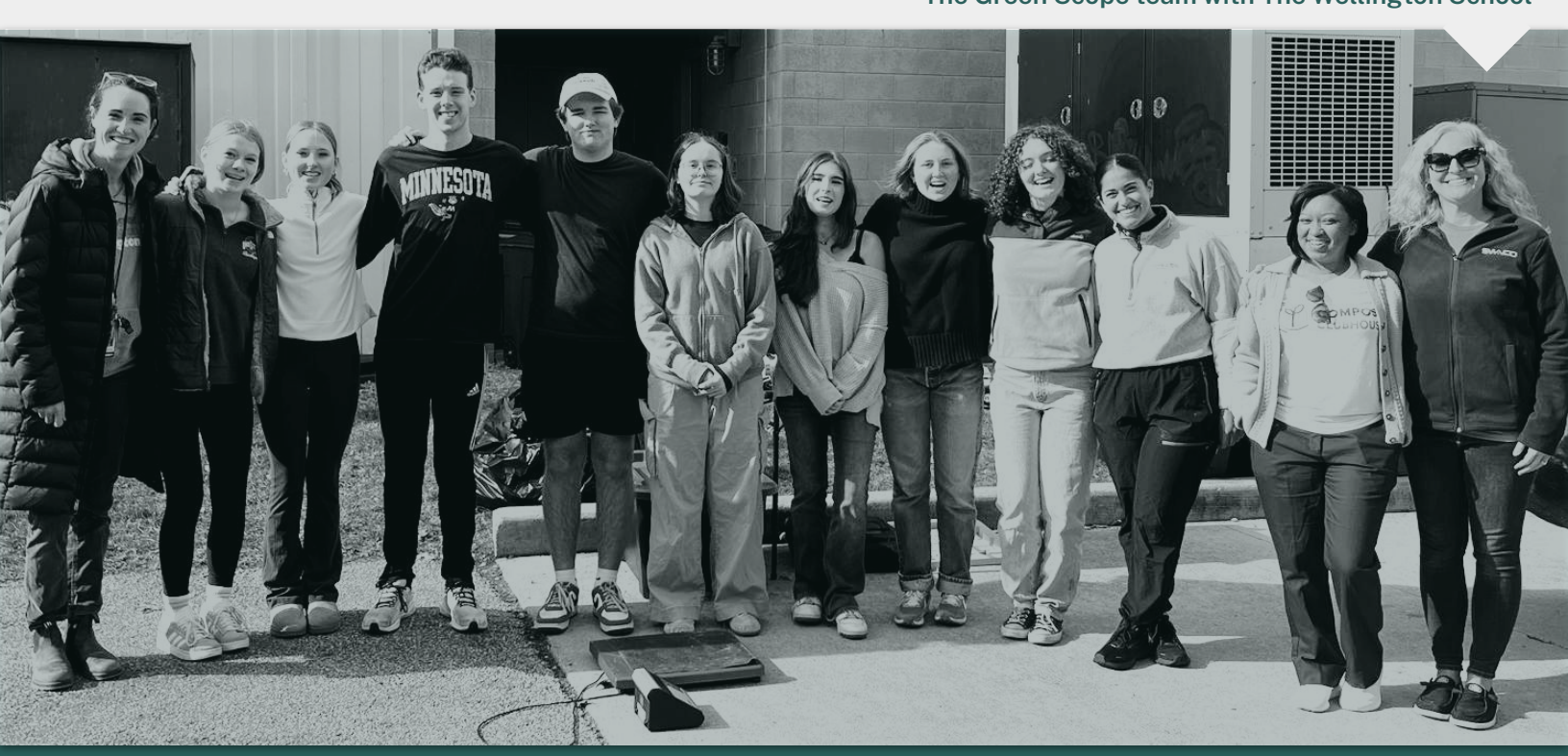
The Green Scope team with The Wellington School