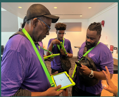
Data & Project Management Services